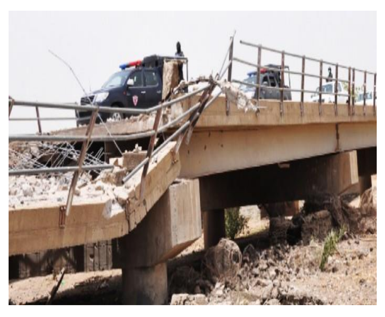
Appendix i A Bombed Bridge on the Nigeria-Cameroon Border